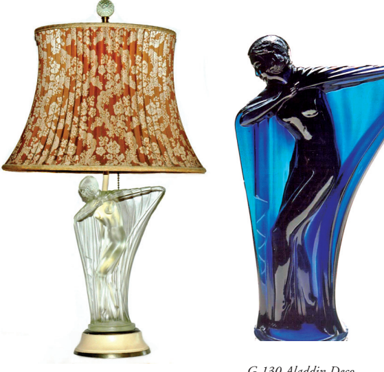
G-70 "Aladdin Deco" figurine lamp with original pleated shade, 1935. These lamps are similar is style to Lalique. $3000.