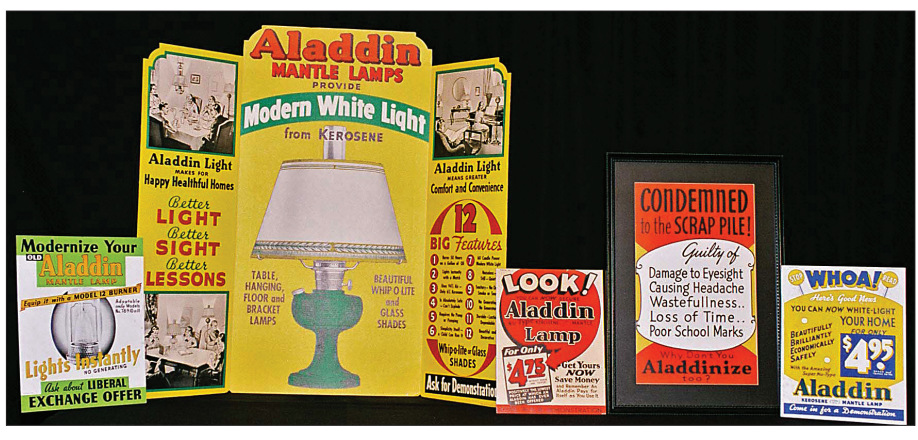
Sign and posters sold in 2008 auction. The 3-fold sign $1400 and posters $100-200 each.