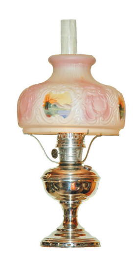
Model 11 table lamp with 550 Swiss Scenic shade, 1922-28. $500.