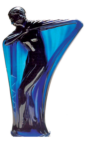
G-130 Aladdin Deco experimental color, 1936-37.