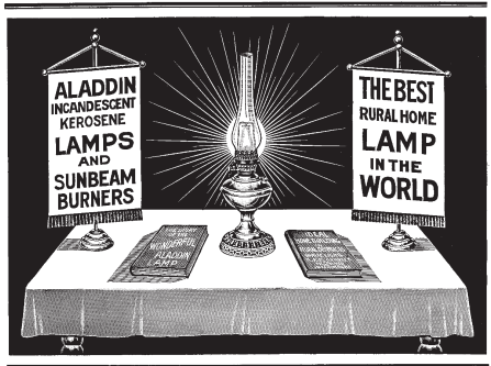
THE MANTLE LAMP COMPANY OF AMERICA Branch Offices: I, Ore. Montreal, Can.