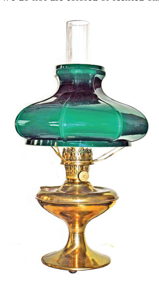
Model 4 Parlour Lamp with 204 cased green shade. 1912. $2500.