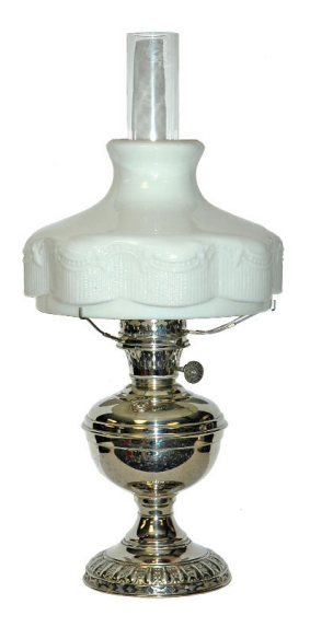
Model 1 Table lamp, embossed foot, with 201 shade, 1909. $600+

Proper use and care of the Aladdin mantle lamp requires some attention. The recommended procedures are explained in the instruction manual that comes with every new lamp. The key points involve proper adjustment. The Aladdin lamp, just like a fine engine, must warm up to proper operating temperatures for best performance. The warm-up process takes about ten minutes. It is important to observe the mantle carefully for a period of 10-15 minutes after lighting and adjusting the wick as needed.