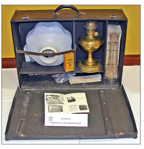
Rare sales case complete with Model 1 table lamp, 201 shade, chimney, wicks and cap mantle. Exhibit in 2008 display room, Indianapolis courtesy Jim Christner.