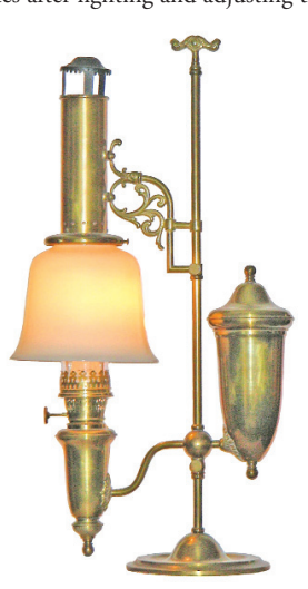
Model 4 Student lamp with 205 shade, 1912. $4000+