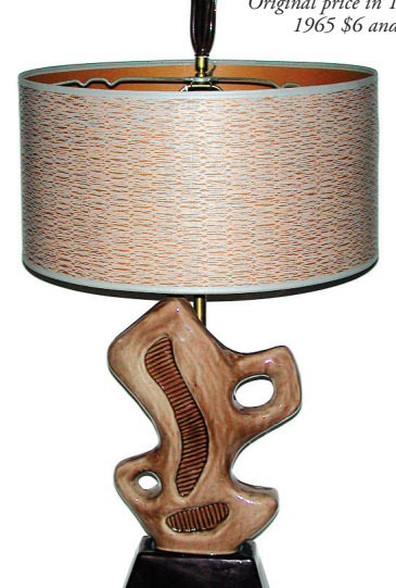
P-406 Pottery "Ugly" with original shade, 1951.