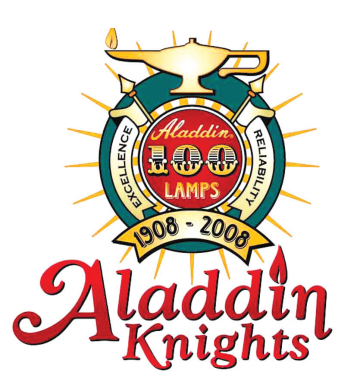
Aladdin Knights logo celebrating 100 years of Aladdin lamps.

Technically, kerosene fueled lamps were obsolete when Victor Johnson trademarked his lamp "Aladdin" in 1908. Cities were promoting new-fangled electricity to light downtown streets and stores. "Great White Way" postcards extolling the fun and awe of the new electric lights are fun to collect for your