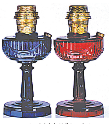
B-76 Cobalt Tall Lincoln Drape with scallops ($1000),1940; B-77 Ruby Tall Lincoln Drape ($700), 1941.