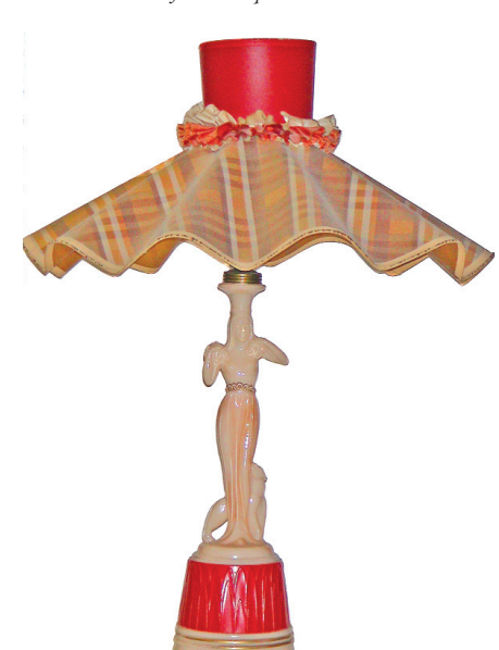
G-343 Alacite Lady with dog, original shade, 1951.